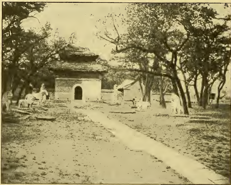
TOMB OF PRINCESS, NEAR PEKING

It is hardly necessary to touch upon the estimation in which woman has been held in China. From cradle to grave she is at a distinct disadvantage as compared to man. Women are spoken of as "moulded out of faults," unworthy of equality with men; and it is only following in the footsteps of their sages that men look upon women with lofty disdain and credit them with much evil, not knowing or caring to discover, much less to cultivate, the good in them.